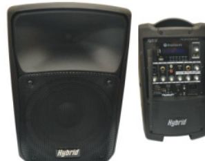
Hybrid PA840 - from R 1,310 Portable Amplified Speaker