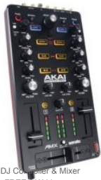
AKAI AMX DJ Controller & Mixer R 4,695 + a FREE AKAI bag