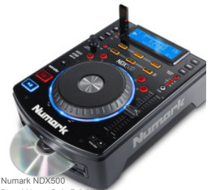
Numark NDX500 Brand New - Only R 3,370

YOU ARE HERE: HOME / FEATURED / BURNI AMAN ON SWEET SCIENCE, LIFE AFTER GODESSA & CAPE TOWN HIP HOP