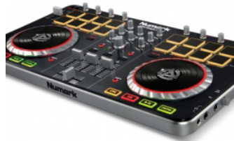
Numark Mixtrack Pro 2 Double Deal Two Controllers for Only R 6,500